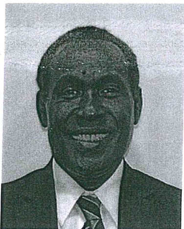
Hon. Connelly Sandakabatu, MP Chairman Bills and Legislation Committee